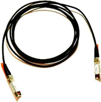
Figure 2. Cisco Direct-Attach Twinax copper cable assembly with SFP+ connectors