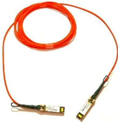
Figure 3. Cisco Direct-Attach Active Optical Cables with SFP+ connectors

Cisco SFP+ Active Optical Cables (Figure 3) are direct-attach fiber assemblies with SFP+ connectors. They are suitable for very short distances and offer a cost-effective way to connect within racks and across adjacent racks. Cisco offers Active Optical Cables in lengths of 1, 2, 3, 5, 7, and 10 meters