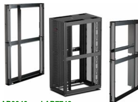
AR3340 and AR7742