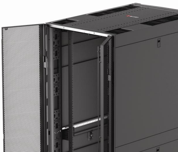
Rear view AR3x4x