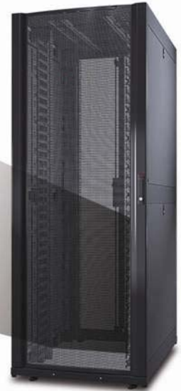
AR3140 – 42U Height