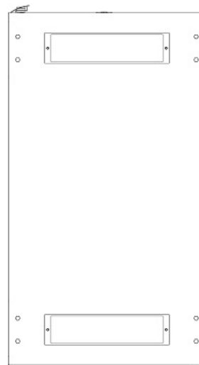
HP V142 Rack - top view