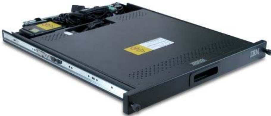
Figure 3. IBM 1U 19-inch Flat Panel Console Kit

Figure 3 shows the IBM 1U 19-inch Flat Panel Console Kit in the closed position.