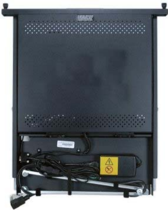
Figure 4. IBM 1U 17-inch Flat Panel Console Kit

Figure 4 shows the 17-inch Flat Panel Console Kit in the closed position.